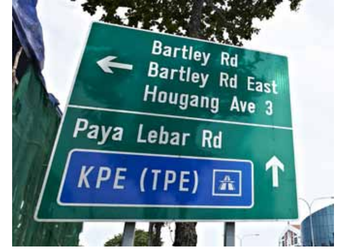
MRT • EXPRESSWAYS