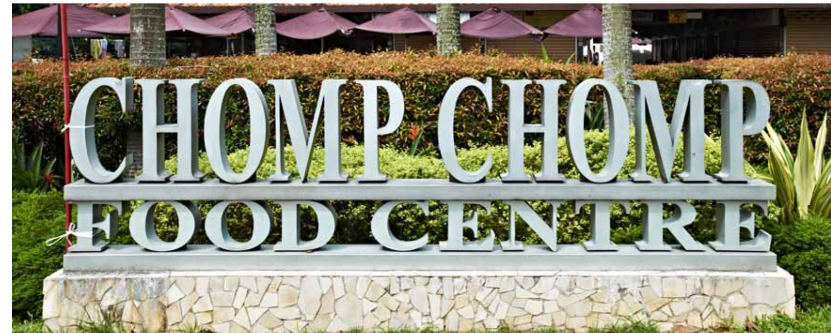
SCHOOLS • AMENITIES