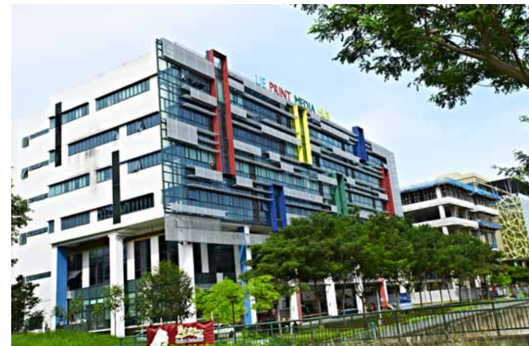
SHOPPING • INDUSTRIES