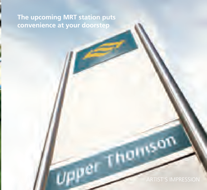
The upcoming MRT station puts convenience at your doorstep