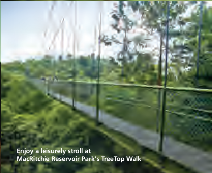
Enjoy a leisurely stroll at MacRitchie Reservoir Park's TreeTop Walk

Thomson has long been regarded as one of the most desirable residential districts and it's easy to see why. With MacRitchie and Lower Peirce Reservoirs close by, there's always fresh air and endless fun for nature buffs. Foodies will relish old favourites and discover new treats within this renowned gastronomic paradise, while parents will definitely love the prestigious schools and institutions nearby. And with Thomson Plaza just across and the upcoming Upper Thomson MRT Station, nowhere else is as ideal when it comes to living and investment.