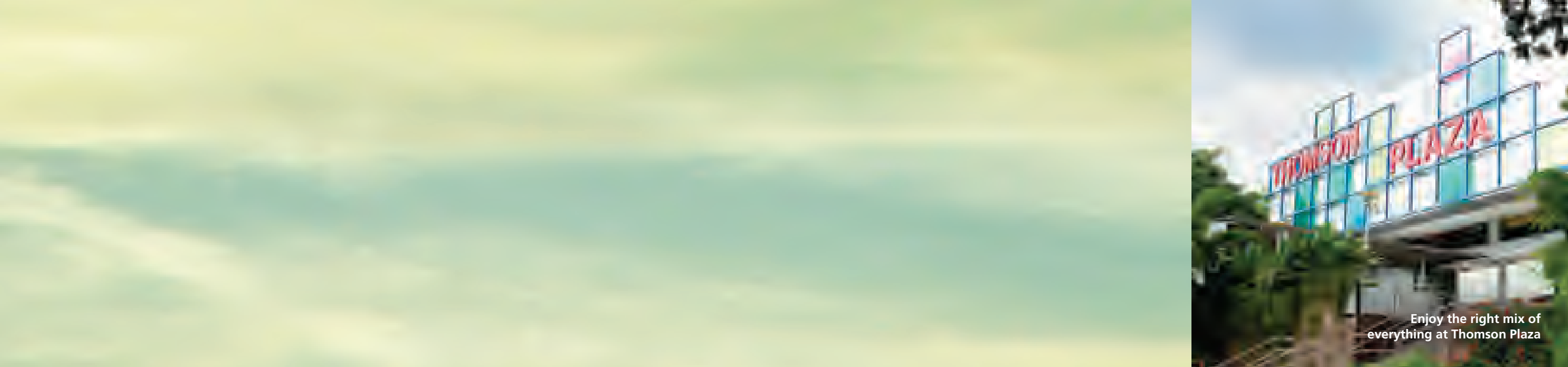
Enjoy the right mix of everything at Thomson Plaza