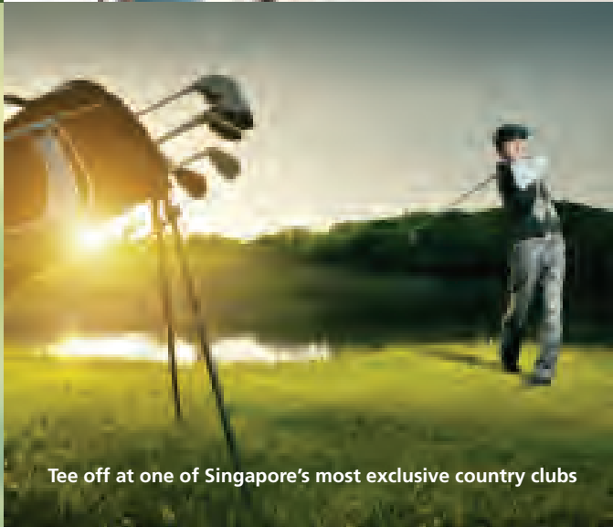
Tee off at one of Singapore's most exclusive country clubs